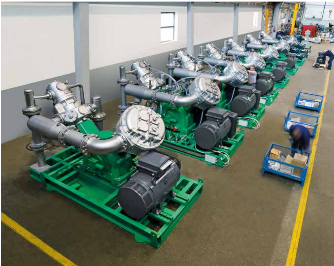
VITO: series production